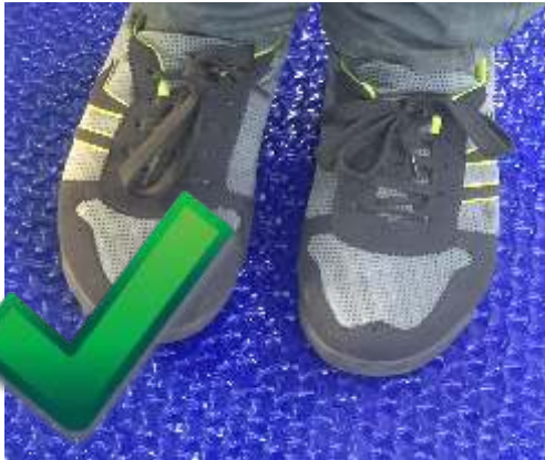
Yotex Floor Protection