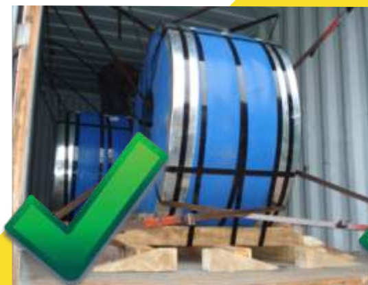
YOTEX Packaging for Coil