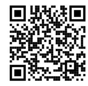
Scan to verify